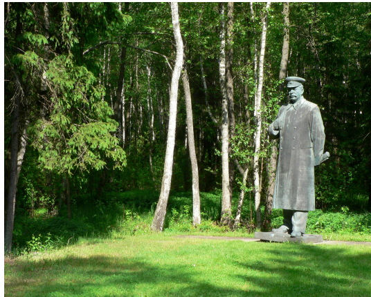
Stalin monument in Grutas park, Grutas village, Lithuania. (moved from Vilnius) Author: Wojsyl, 2005

On the way back to Poland we will stop at Grutas Parkas: a park containing political sculpture and statues of the Soviet-era and an exposition of other Soviet ideological relics from the times. You will view the social-realist art of the Communist period which promoted personalities such as Lenin, Stalin, Trotsky and others, and the heroism of Communist life. Lithuania suffered greatly as an "SSR" of the Soviet Union. We will talk a bit about the recent history of both countries.