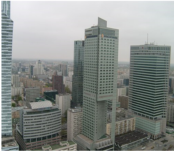
Back in Warsaw,

Finally, there is our farewell dinner in one of the Warsaw's restaurants (3 course menu with water, tea or coffee)