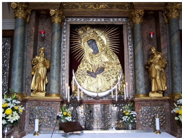
Ostra Brama Shrine

Dinner (3 course menu with water, tea or coffee)