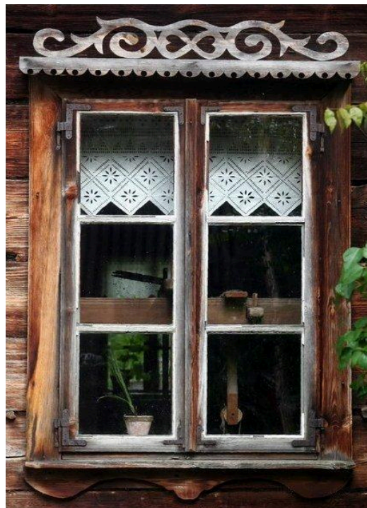
Traditional Kurpie paper artwork and window decor

Guided tour and workshops in the private Kurpie Museum.