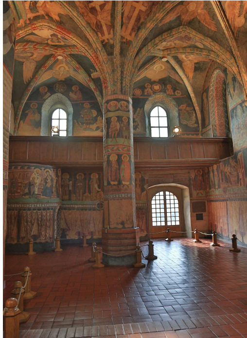
Trinity Chapel in Lublin,

That is why the city attracted not only Poles, Russians, Jews and Germans, but even Scots, Italians, the French, Hungarians and Armenians! Entrance to the Lublin Castle and its famous Holy Trinity chapel with Byzantine paintings.